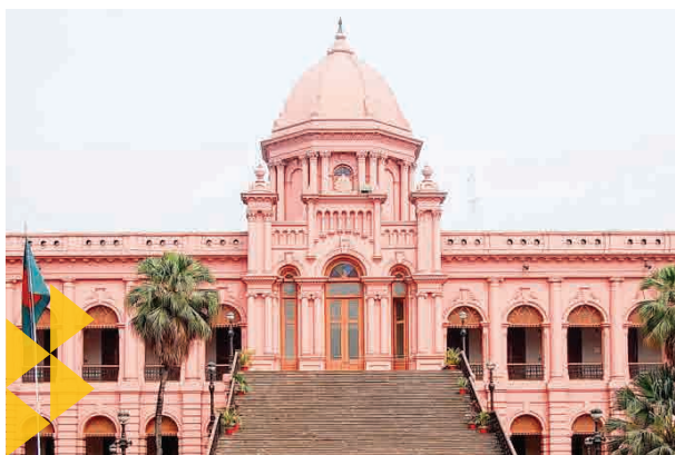
Image: Ahsan Manzil Dhaka