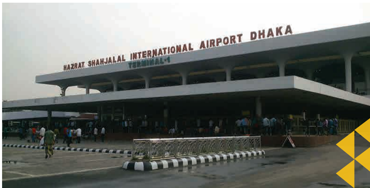
Image: Hazrat Shahjalal International Airport, Dhaka

Welcome at Hazrat Shahjalal International Airport, the largest airport in Bangladesh located in Dhaka city. There will be several arrangements to offer necessary assistance. Some of the welcome packs are-