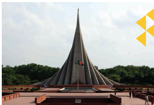
Image: National Morticians Memorial, Savar, Dhaka